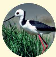
POAKA PIED STILT ( Himantopus leucocephalus )