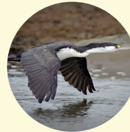
KĀRUHIRUHI PIED SHAG ( Phalacrocorax varius )