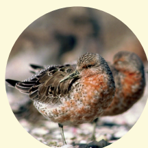
HUAHOU LESSER KNOT ( Calidria canutus )