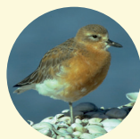
TŪTURIWHATU NEW ZEALAND DOTTEREL ( Charadrius obscurus aquilonius )