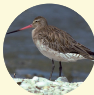
KUAKA BAR-TAILED GODWIT ( Limosa Lapponica baueri )