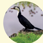
KAWAUPAKA LITTLE SHAG ( Microcarbo melanoleucos )