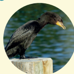
KAWAU BLACK SHAG ( Phalacrocorax carbo novaehollandiae )