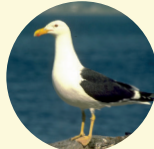
KARORO BLACK-BACKED GULL ( Larus dominicanus )