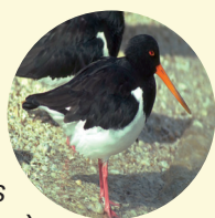
TŌREA SOUTH ISLAND PIED OYSTERCATCHER ( Haematopus finschi )