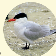
TARANUI CASPIAN TERN ( Hydroprogne caspia )