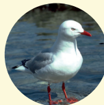
TARĀPUNGA RED-BILLED GULL ( Larus novaehollandiae )