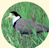
SPUR-WINGED PLOVER ( Vanellus miles novaehollandiae )