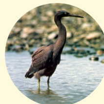
MATUKU MOANA REEF HERON ( Egretta sacra )

Find out more: visit tiakitamakimaurau.nz