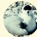
TARA WHITE-FRONTED TERN ( Sterna striata )