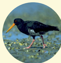
TŌREAPANGANGO VARIABLE OYSTERCATCHER ( Haematopus unicolor )